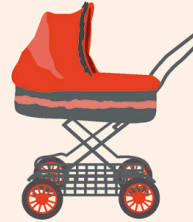
baby buggy (US) pram (UK)