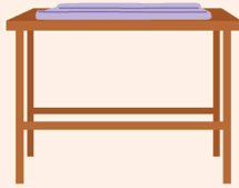
changing table and mat