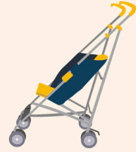
stroller (US) buggy (UK)